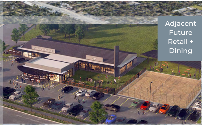
Adjacent Future Retail + Dining